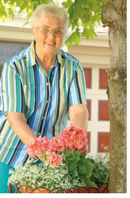
We hope you enjoy "This Is Living." Read more to learn about what life is like at Ohio Living Cape May and the upcoming programs we offer!